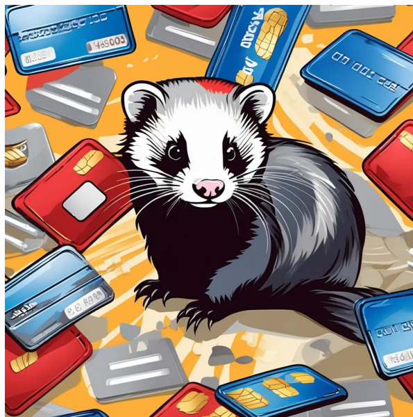
Figure 1: Ferris practicing his favorite activity.

Ferris doesn't even understand that the inverse transformation will be ambiguous. All he cares about now is writing and deleting digits. In order to make his learning as efficient as possible, you should minimize the number of digits Ferris has to insert or remove to obtain s_{\mathbf{v} + \mathbf{1}} from s_{\mathbf{v}} .